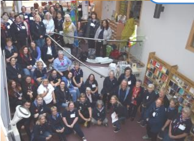
Group photo from the Training Day