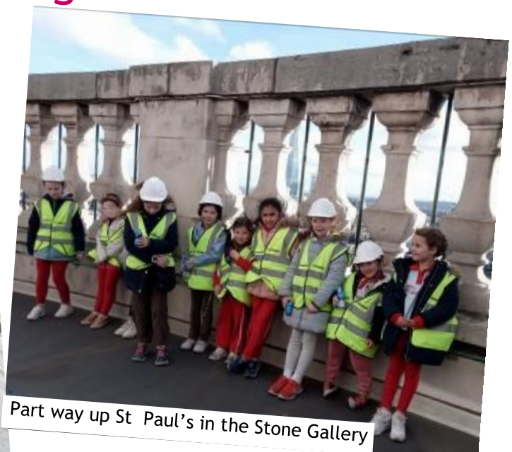
Part way up St Paul's in the Stone Gallery