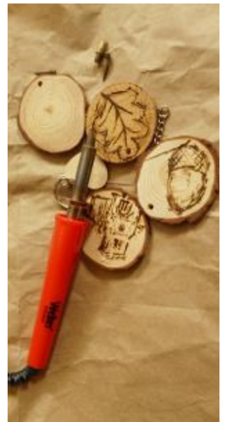
A pyrography tool in action—it decorates by burning wood or MDF blanks

If you wish volunteer or find out more about the craft library email_comms.ggew@gmail.com