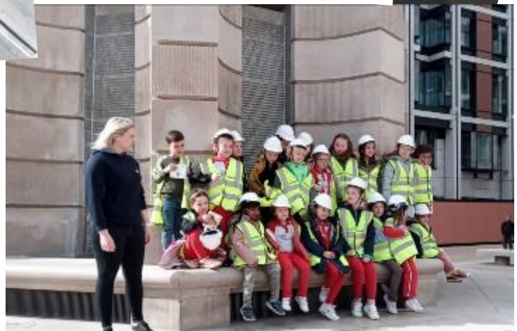
Theydon Bois Rainbows (and some Brownies) in Paternoster Square for a treasure hunt