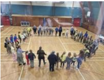
Harlow Division Thinking Day Division event

Units can take part by planning UMAs or Skills Builders in that week and promoting their involvement on Social Media. Activities could include Guide litter picking, Upcycling or Fixing Interest badges, , Brownies Un-fantastic plastic, or Insect Invaders, Rainbow Recycling or Bug hunt UMAs or planting bee friendly flowers (Helper Interest Badge),