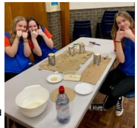
Guides making pancakes in a can