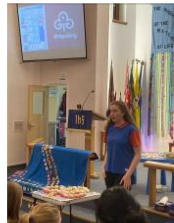
Guides Thinking Day