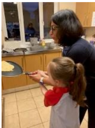
Rainbows making pancakes

Hornchurch Division is formed of 4 districts and covers Hornchurch, Elm Park and Rainham. There are 30 units - 8 Rainbow, 14 Brownie, 7 Guide and 1 Ranger. Many of the leaders run or help at more than one unit, so we have a multi-skilled group of volunteers.