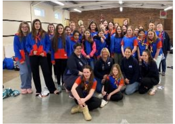
Thurrock West craft weekend at Thriftwood in January

Why not take a look at the website and see if this is something you can promote within your unit.