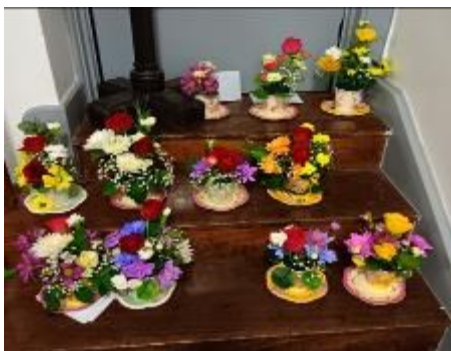
Mothers Day flowers in a teacup— thanks 2nd Buckhurst Hill for the idea