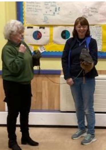
Meeting an owl

presentation evenings to present Silver and Gold awards to their girls. And 4 Units recently joined together and went to the Premier Cinema in Romford to see "Wish".